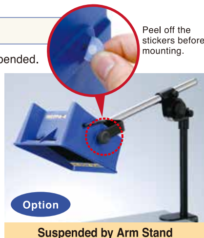
Suspended by Arm Stand

Powerful absorption at closer area with high flow rate. Because of low height, it gives less shade keeping your working area light.