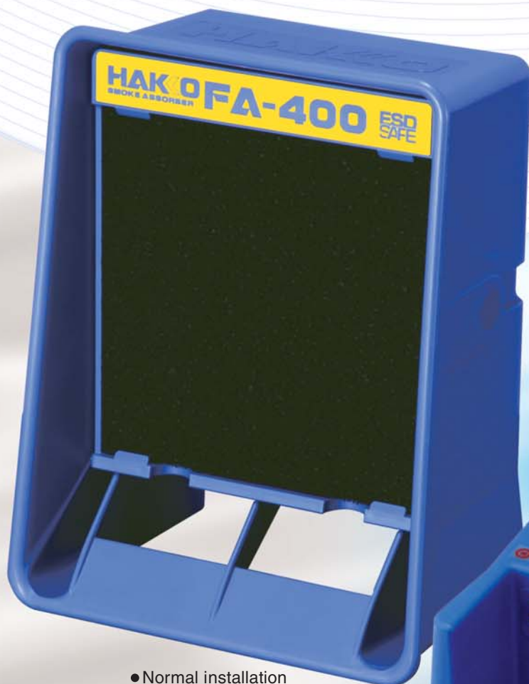
● Normal installation