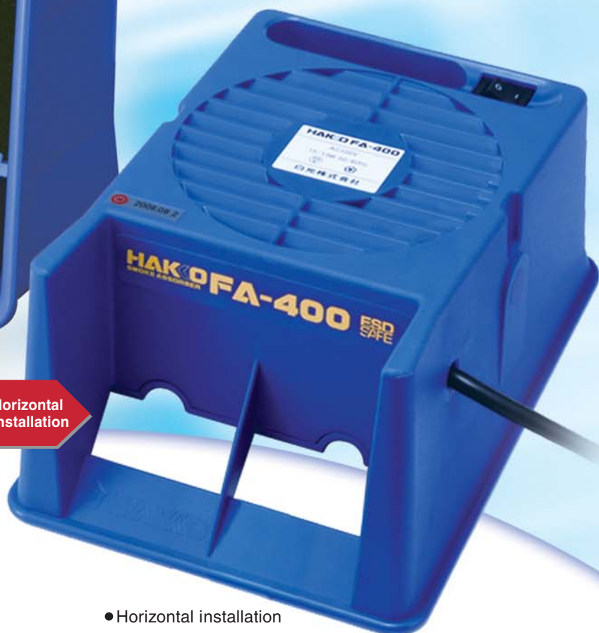
● Horizontal installation