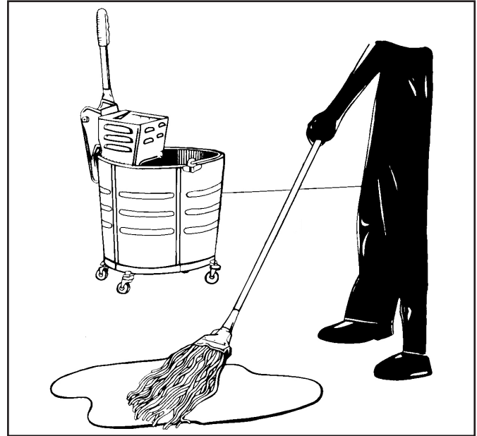
Figure 3. Applying the Statguard® Low Residue Floor Stripper with a cotton mop