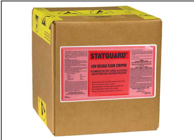
Figure 1. Statguard® Low Residue Floor Stripper